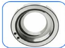
- Dynamic Balanced Nut Available The collet nut is available in a true dynamic balance, this nut comes standard on "SG" series holders.