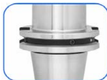
- True Dynamic Balance HPI ER collet chucks are dynamically balanced not production balanced.