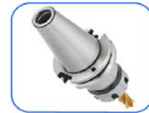
- DIN Coolant Hole Form AD/B coolant holes are available standard on "SG" series holders and DIN form B is available upon request.