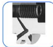
- Through Hole Depth Adjustable Screw Standard Coolant through the center of the spindle is available as standard.